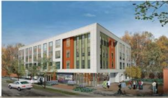
Artspace $13 million campus coming to Brookland

Rhode Island Station: Now under construction this mixed-use development is on an 8.78-acre site located at the Rhode Island Metrorail station. The project will include a residential component featuring 274 residential units. The development will also include a 215-space Metro garage (56,000 sq. ft.) The 70,000 sq. ft. of retail stores will be located along a traditional main street that includes outdoor seating, heavy landscaping and ambient lighting. The retail is expected to be available in 2011, but the rest of the project may not deliver until late 2013.